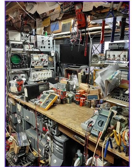
The President's Workbench.