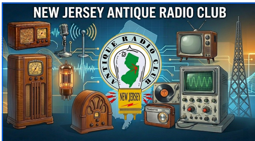
Our new Facebook page cover photo