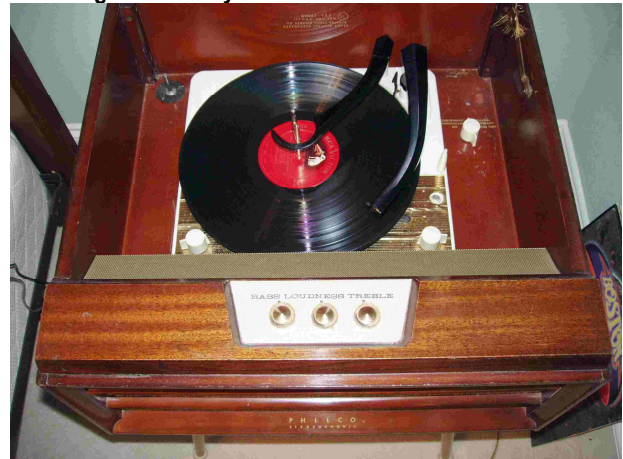
Philco relied on Voice of Music changer on this model.

My wife is very particular about what can be displayed in our new house in Myrtle Beach. She has given the green light to use my early Philco stereo as end tables in the guest bedroom. This is an unusual set that contains a separate amplifier in each cabinet. So each unit has to be plugged into an AC outlet separately. And while the main unit with the record changer shuts off automatically at the end of play, the other amplified cabinet does not. Both amps feature separate bass and treble controls and the cabinets contain woofers and tweeters. This model uses a Voice of Music changer that works very well. Sound quality is pretty good but does not measure up to the similar RCA Victor models from this era (1958).