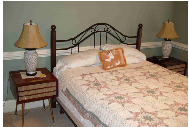
Guest bedroom sports an early stereo Philco multispeed hifi doing double duty as end tables.