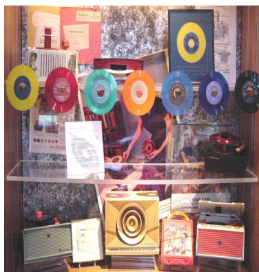
45 RPM Display at Sarnoff Library (2005 through 2009)

that inventions do not spring up like mushrooms, but are the result of concerted activity by people like themselves.