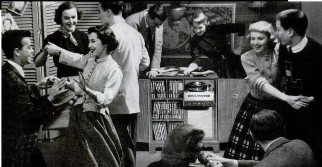
Folks enjoying music on the all new 45 system in 1949. AM and FM radio were also an option