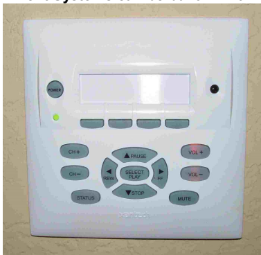
Wall Unit Controller provides 4 choices of input to 4 different areas of the house. You can even control fast forward and reverse.