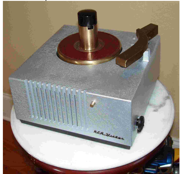
Fire Player -after-

It now plays and sounds great but there is still one issue with it. Despite all the cleaning, it still smells smoky, especially after it plays for awhile! Any thoughts on how to get rid of the odor? My wife has moved it to the garage until the odor problem is remedied!