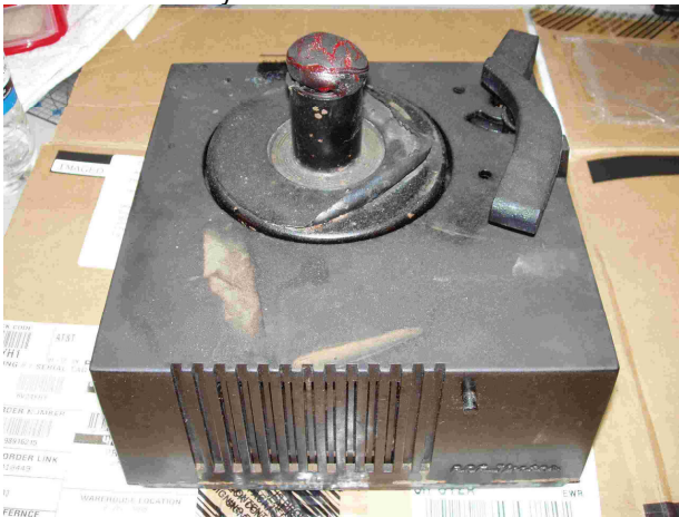
Fire Player -before-

This year at the AWA Charlotte Conference I found the saddest looking 45 player I've ever come across. It's a 9EY3 from 1949 which was damaged by a house fire. Interestingly the AC power cord was intact, while the cartridge wires were melted along with the volume control and the spindle cap. The entire machine was coated with black soot inside and out. The bakelite case was intact having a higher melting point than the other plastic parts. The heat caused many of the moving parts to bind up including the speaker cone. But after some flexing back and forth I was able to free up the speaker cone and it actually sounds fine now.