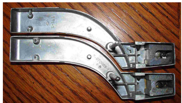
Rp168 arms to accommodate different size cartridges