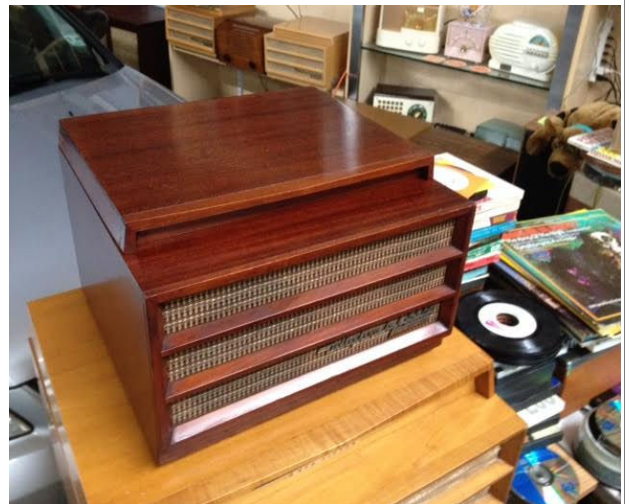
7HF45 case after restoration