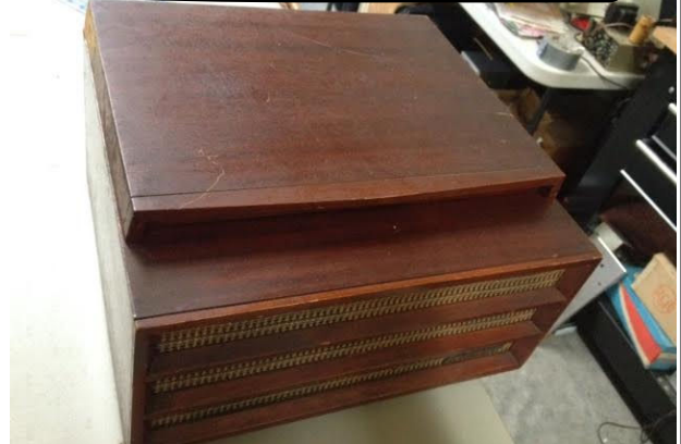
7HF45 case before restoration