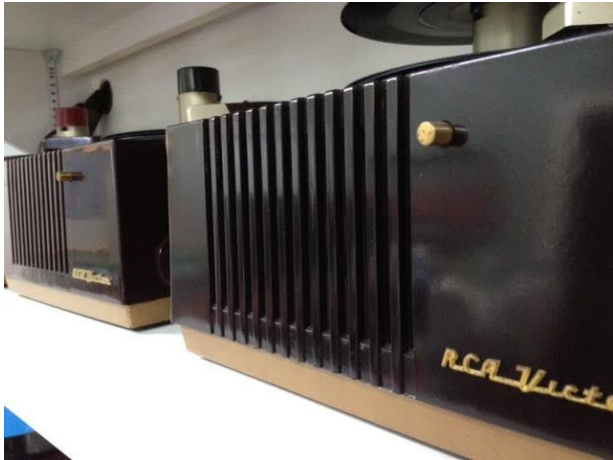
Very Early 9EY3 shown next to later 9EY3