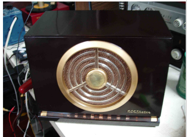
RCA Victor Bakelite table radio after restoration