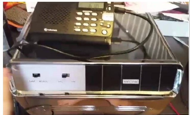
RCA Victor record player for your car . Modern answering machine on top of player is not necessary for proper operation!

For more pictures of the player and the car it is installed in, check out https://photos.app.goo.gl/Hc3vRNJnEYeDK1WC8 .