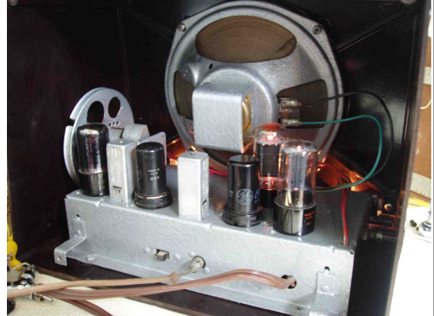
After picture of RCA radio chassis