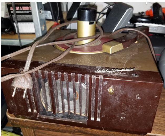
Sad looking model 45EY ready to be saved