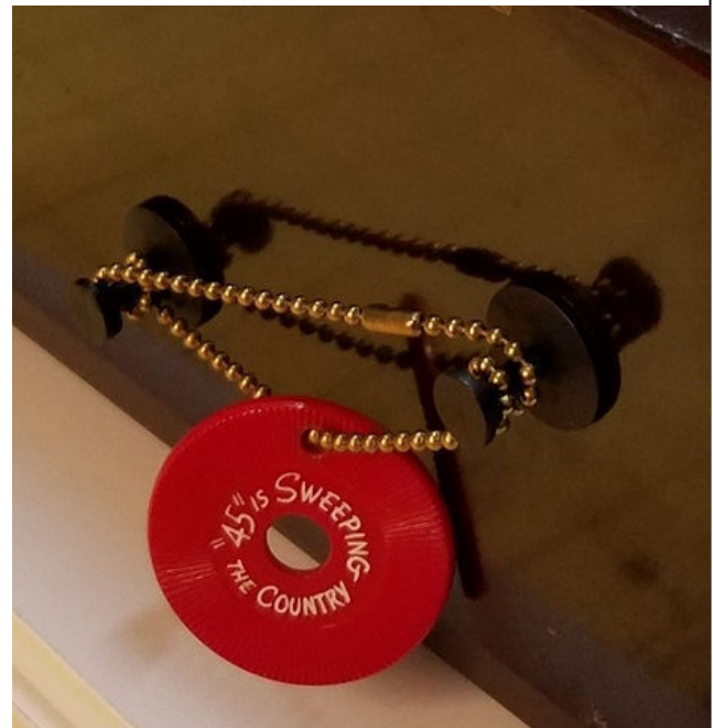
Keychains with colored mini records were available when the 45 system was first introduced