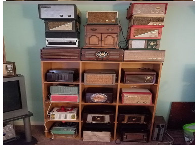
Room of 45s and Wall of Phonos