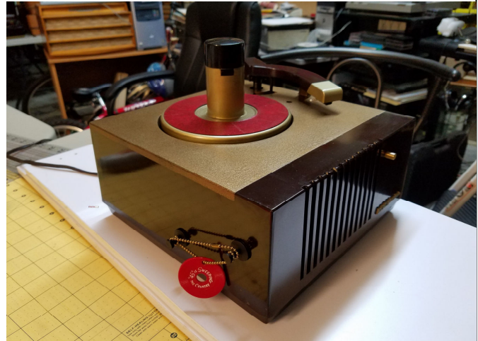
Older cabinet with bakelite armrest. Newer models provided an armrest underneath the motorboard. This simplified the bakelite mold.

Restoring the record changer was also troublesome. As happens sometimes the star wheel was stuck to the main turntable shaft. After removing the setscrews and spraying in the holes with penetrating fluid and leaving it overnight, it would not budge. The next step should have been to use a gear puller. But when I couldn't locate the puller I did the unthinkable. I tried to pry the star wheel off with a screw driver. I ended up bending the bottom of the turntable shaft. I tried to carefully bend it back and broke it off! Oh, no problem. I have plenty of spare turntable shafts. Let's see, there is the shaft with the gear on top for the rotating type separators. And there is the shaft for the in-out separators. But wait, this spindle is short and uses the in-out separators. This model is the only model that uses a different size spindle shaft! And I don't have one here in Myrtle Beach. Luckily I had one in my parts collection in New Jersey. The rest of the restore went smoothly.