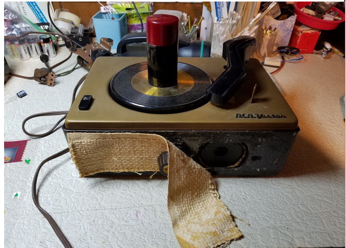
Amateur custom job has seen better days