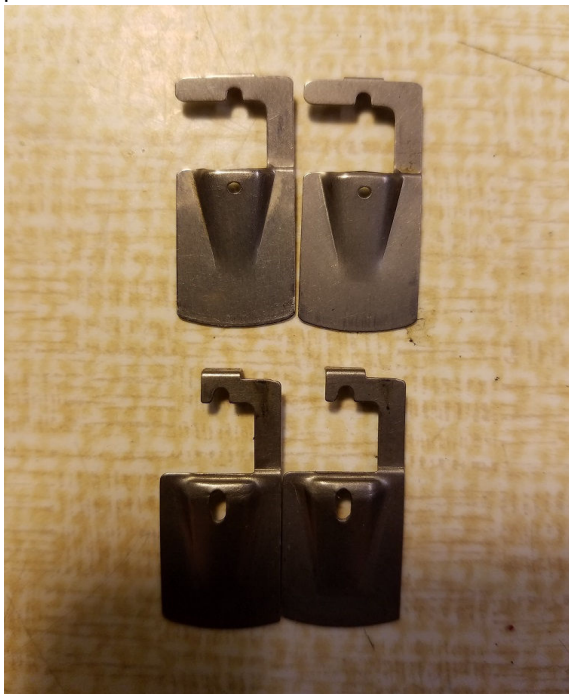
First and second generation of push out separators

Another type of spring was added to the push out separators to facilitate returning the separators back into the spindle at the end of the dropping cycle. There is a simple test to see if the spring is working properly. Put a full stack of 14 records on the spindle if it is an rp190 or 10 records if it is an rp168. Cycle the first record and see if the remaining stack drops onto the shelves at end of cycle. If the records don't drop down, it means the shelves have not gone back into the spindle. The added weight of the full stack and friction between the record label and the separators has not been overcome by spring tension. When the spindle is apart examine the spring and make sure the 2 ends are just about touching each other. If there is a sizeable space between them, that is causing the problem. You may be able to carefully bend the ends of the spring back to the correct alignment.