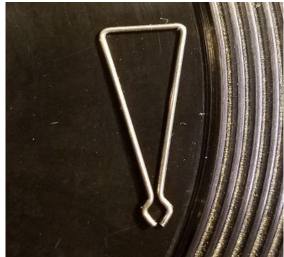
Push out separator spring