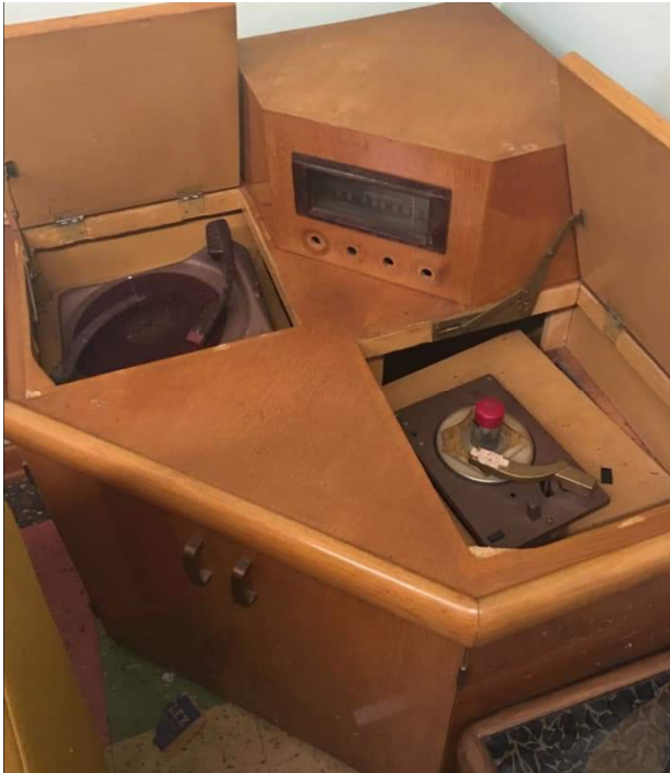
Lots of different angles to take into account with this well made custom cabinet