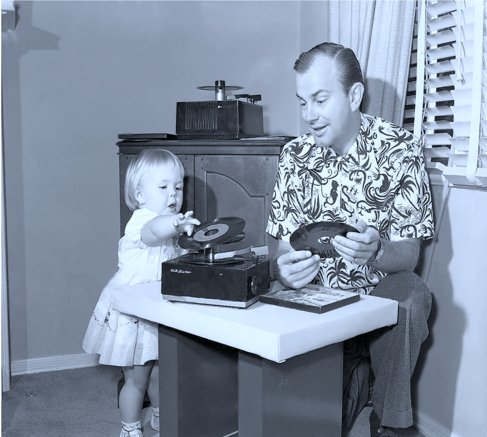
Even Jack Paar was involved with advertising the new RCA Victor system of recorded music