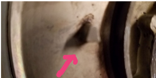
Bottom of turntable highlighting metal piece that triggers reject cycle

The extrusion underneath the turntable must engage with the trip pawl. When you here the click it means the two parts are hitting each other but not engaging.