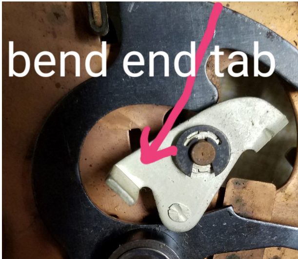
Carefully bend this end piece so it engages with triangular piece shown below

1- You push in the reject button and you hear the usual clunk or click to start the cycle but the machine does not reject. Now each time the turntable rotates for one cycle, you hear the click noise again. Once again it does not reject. This means the trip pawl is out of adjustment and the only way to adjust it is to carefully bend the part shown below.