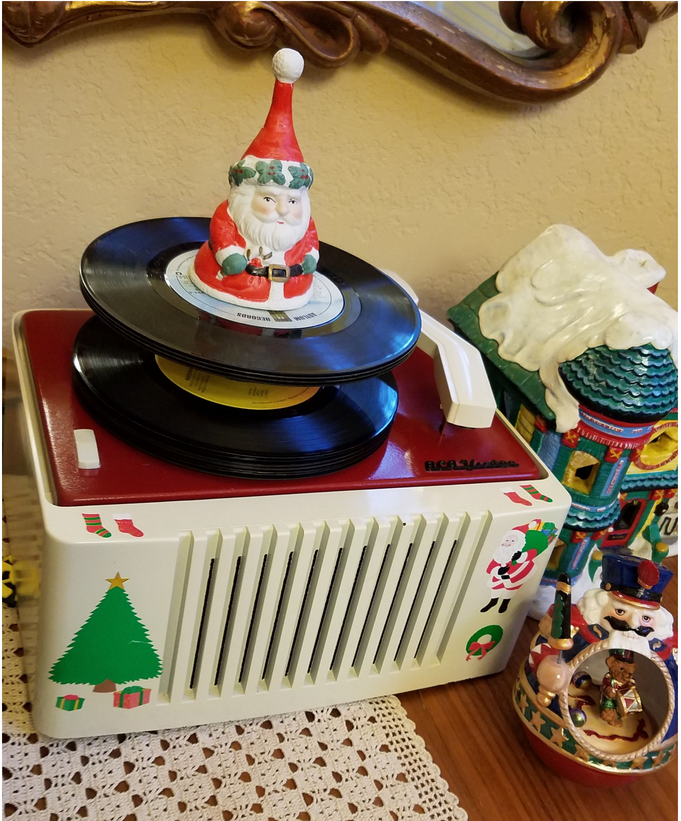
Santa gets a ride on a customized 45EY2 decked out for Christmas