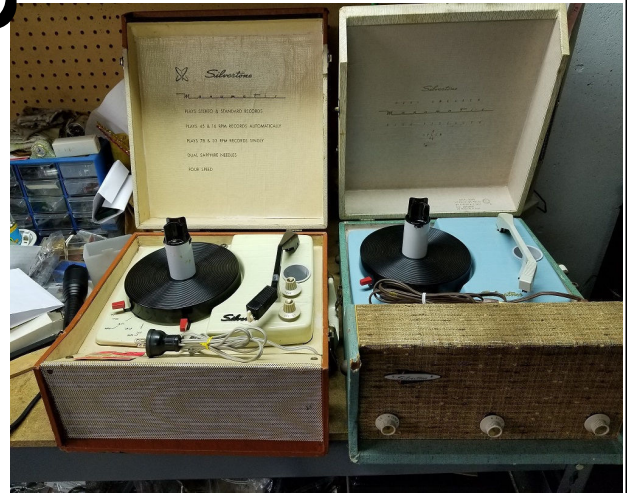
1958 and 1959 portable models

Turntable removed showing how little there is underneath. Tonearm is controlled by a cam under the turntable just like the RCA Victor RP-168.