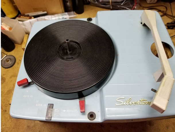
Silvertone Manumatic record changer

Silvertone's Manumatic. A very strange design.