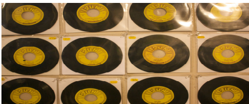
Sun records, I bet you have a few

Can you imagine assembling those spindles 8 hours a day? I love these things but I think that would break me.