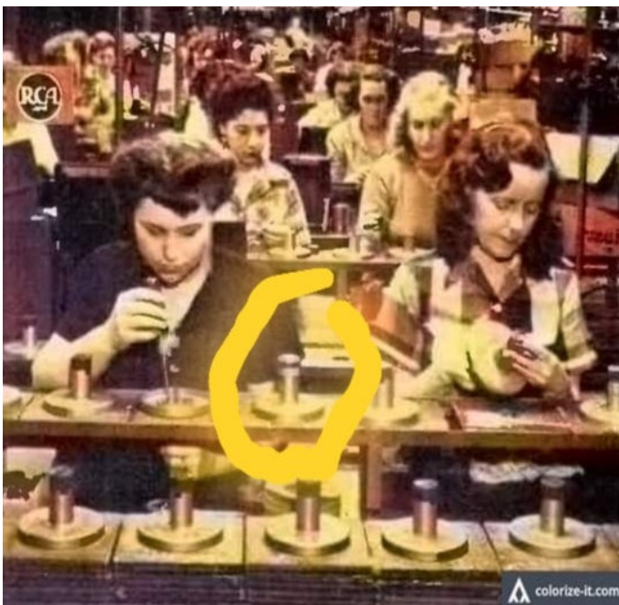
RCA factory workers assembling spindles

There is a very good likelihood that your 45 player was assembled by a woman.