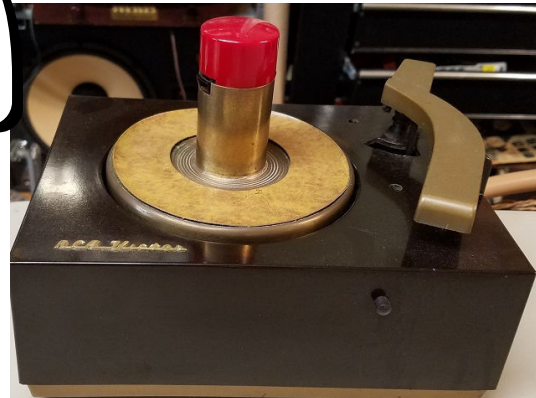
9JY renamed 45J in 1950

Many of the 45J2s made by Crescent have a much brighter red spindle cap.