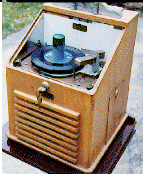
Ristaucrat Nonselectible Jukebox