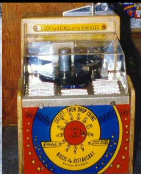
Ristaucrat Selectible Jukebox